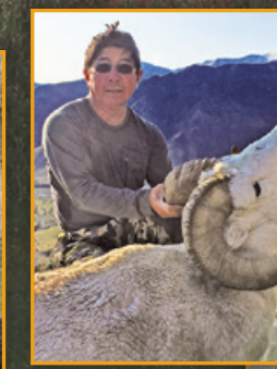
Francis (Ohio): two animals in one day Guide Cass