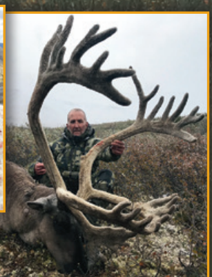
Rich (Wisconsin): close to 160 B&C Guide Foster