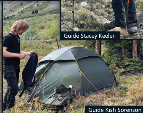
Guide Kish Sorenson